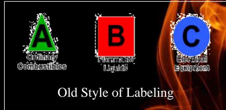
Old Style of Labeling