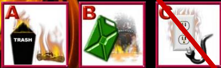
New Style of Labeling

Be advised that most fire extinguishers will function for less than 40 seconds.